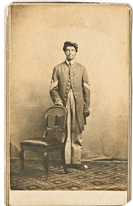
Unidentified USCT soldier