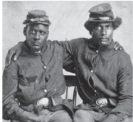
“Two Brothers in Arms”, tintype of unidentified Union soldiers taken between 1860 and 1870