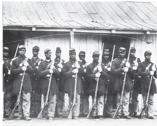
Members of the Guard of the 4th Infantry Regiment, U.S. Colored Troops, At Fort Corcoran Washington, D.C.