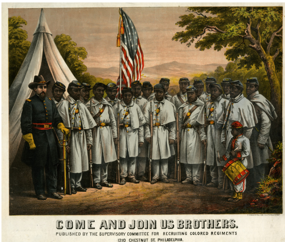
1863 poster published by the Supervisory Committee for Recruiting Colored Regiments, depicts U.S. troops at Camp William Penn, a training camp for black Union soldiers near Philadelphia

Students should not read the essay to the board: students should prepare an outline of key points and present them with emphasis. The board may ask clarifying questions. The students' presentation should address: (1) the ratio of sick to healthy soldiers in the 4th US Heavy Artillery; (2) the amount of manual labor performed by soldiers; (3) the examination of recruits; (4) and the location and circumstances of their camp site.